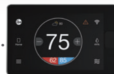
EcoNet Smart Thermostat